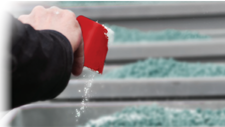
Photo below shows N Bolst-R on seed.